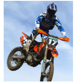
Bikes to Belize! OK, maybe the pastors didn't do this right away!

trip to Belize in which they gave 23 local pastors new motorcycles. The three they shipped down there 3 years ago have been used to start 20 new churches! In the past month we have learned that the recent shipment has already been used to start churches in 4 different villages! All of these trips have also inspired them to think even bigger about sponsoring disaster relief efforts, and other ways to bless those who are in need. We are excited about our new church!