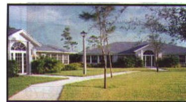
Rainbow Christian Academy is online, just put www in front and .com behind - oh, and take out the spaces! ☺