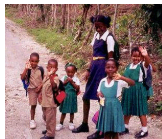
The medical team to Jamaica was a bunch of miracles in a row! Please read the first article, or for even more of the story visit our website at http://www.kerribbean.com/miracles/

9. All ordination events will go smoothly in the Northwest in April. Thanks for your prayers!